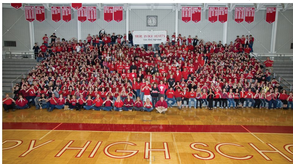
Perry High School students and staff gathered in the Competition Gym for this group photo that was sent to Chardon High School to show our support. (...continued on page 8)