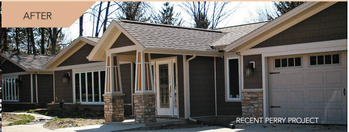
RECENT PERRY PROJECT

From new home construction to kitchen remodeling, we build it better for less than you would expect. In Northeast Ohio, the word is spreading about Paramount's uncompromising principle of "excellence everyday."